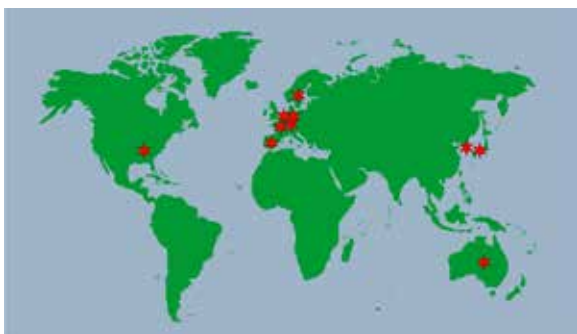
Red meat allergy – described worldwide

To date, cases of \alpha -Gal-associated meat allergy have been reported in the southeastern US (22) , Australia (3, 6) , Asia (18, 24-26) , and in several European countries, including France (4, 11, 27) , Spain (28) , Germany (29) , Switzerland (30) , and Sweden (31) .